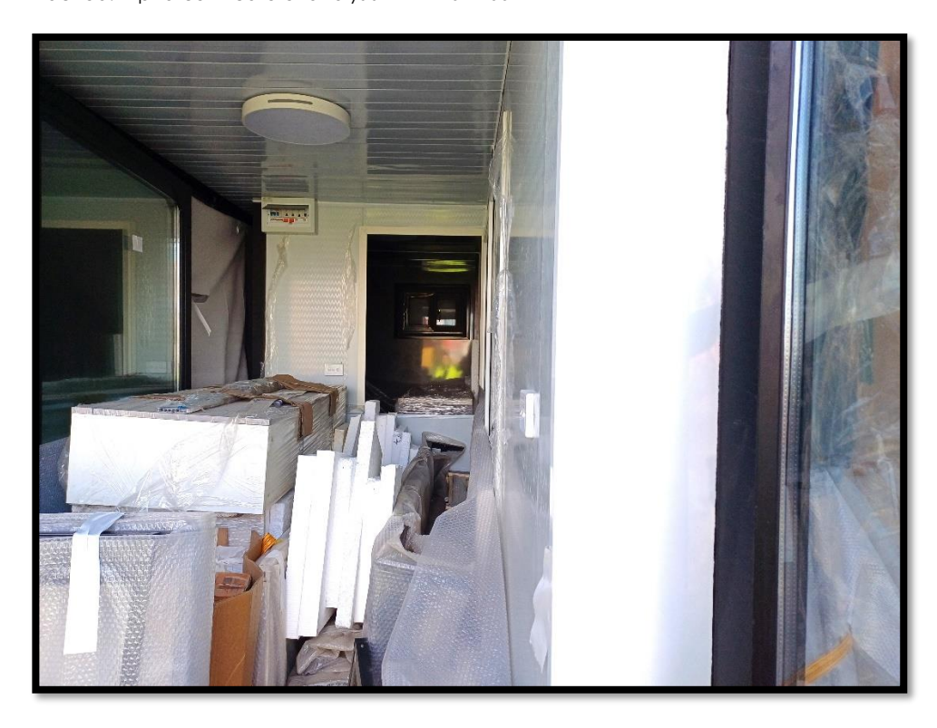
Figure 1: The Shipment

Attached: Alpha certificate of analysis AL2412044-001